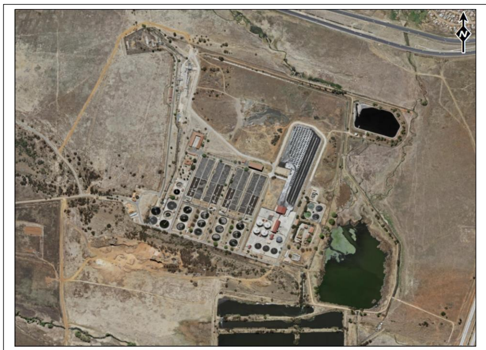
Figure 1: Location of the Bushkoppie WwTW

The proposed development will trigger the requirement of a Basic Assessment process to be undertaken in terms of Listing Notice 1 (GN. R983) and Listing Notice 3 (GN. R985), as amended, of the EIA Regulations 2014, as amended. A Water Use License (WULA) in terms of section Section 21 of the National Water Act (NWA) (36 of 1998), as amended will also be required.